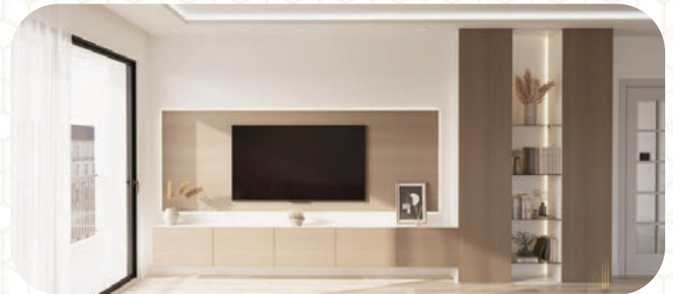
TV wall & built-in storage