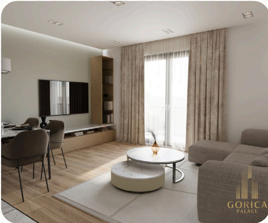
Living room & dining

Soft neutrals, warm wood, and clean detailing