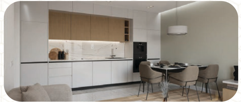
Kitchen & dining